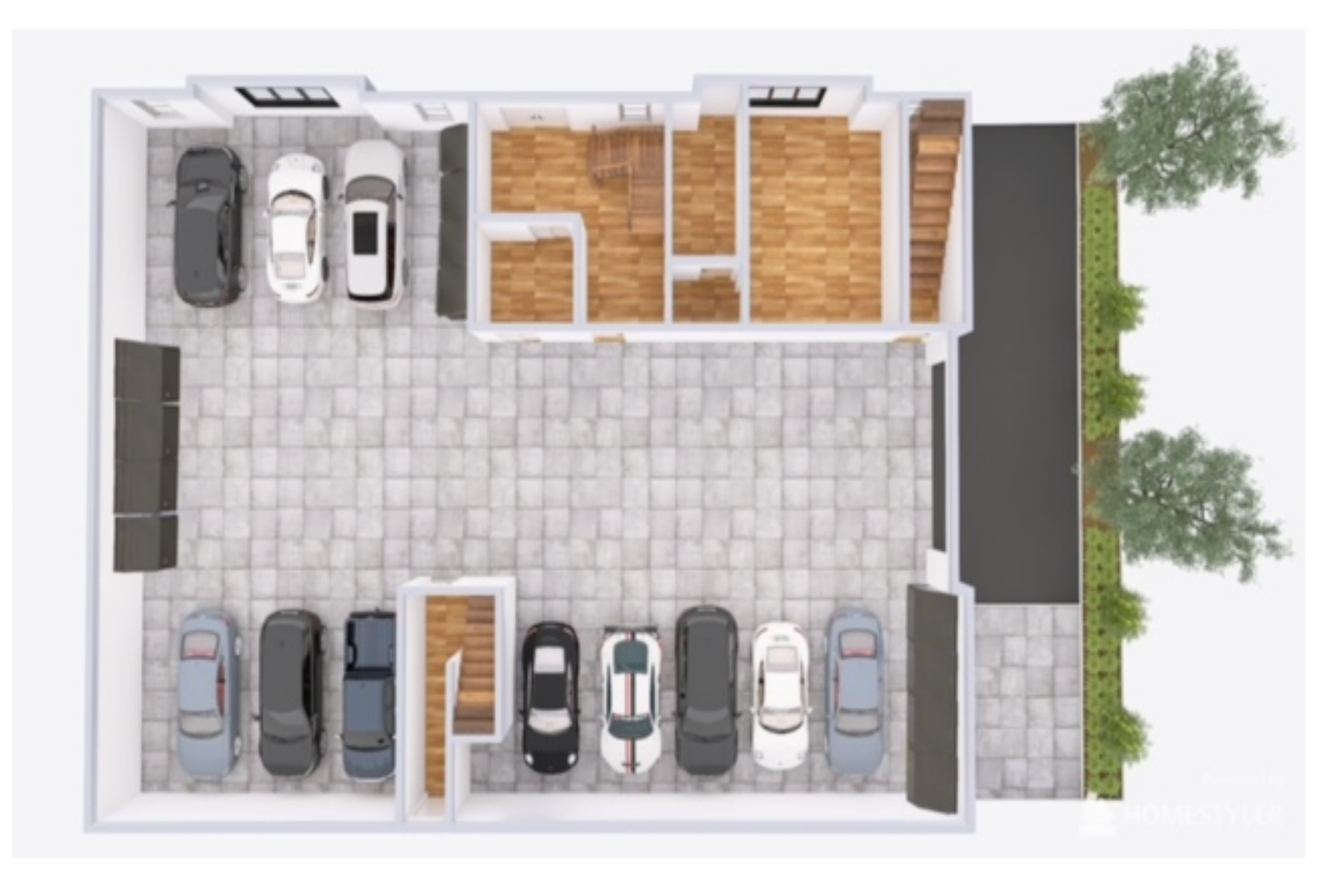
Garage Parking 11 Spaces